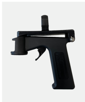
SPRAY AID Ergonomic