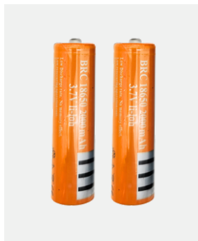
2 X 18650 ERSATZ-AKKUS Art. 264 Suitable for MR 96 E