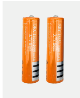
2 LITHIUM-ION BATTERIES Type 18650