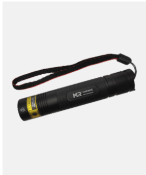
MR 96 E UV LED flashlight