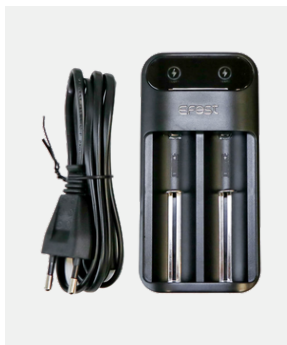
CHARGER Forr 2x Li-Ion Battery (Charging time 4 hrs.)