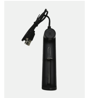
USB CHARGER For Battery Type 18650