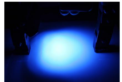
(Hand yoke not part of the scope of delivery)